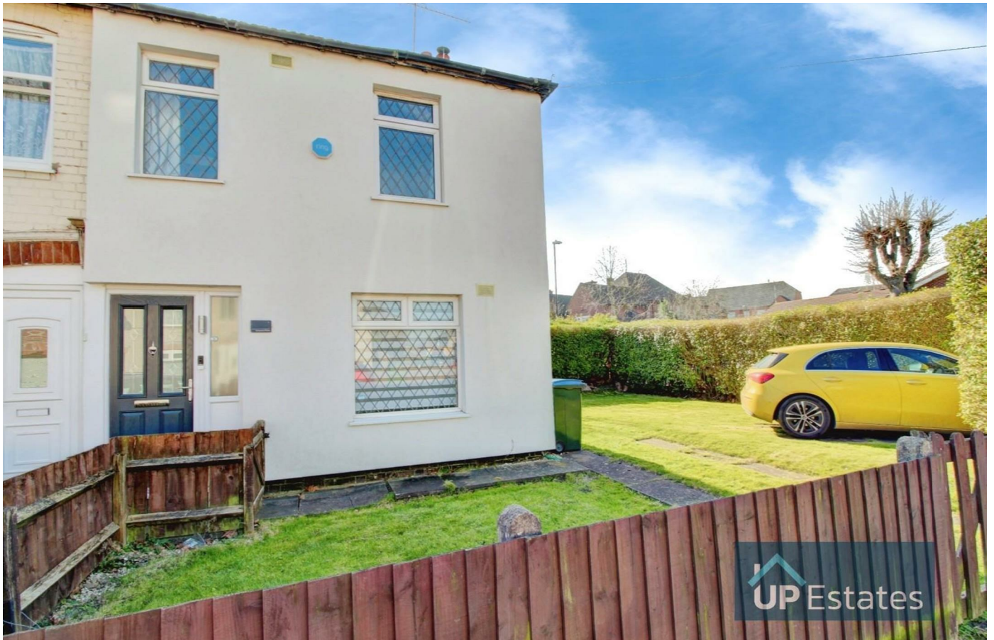
Ashmore Road, Coventry